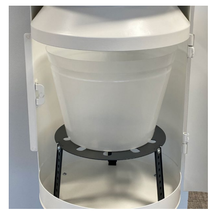
In this Birde 500, is moisture protection and Organic waste shelf placed.