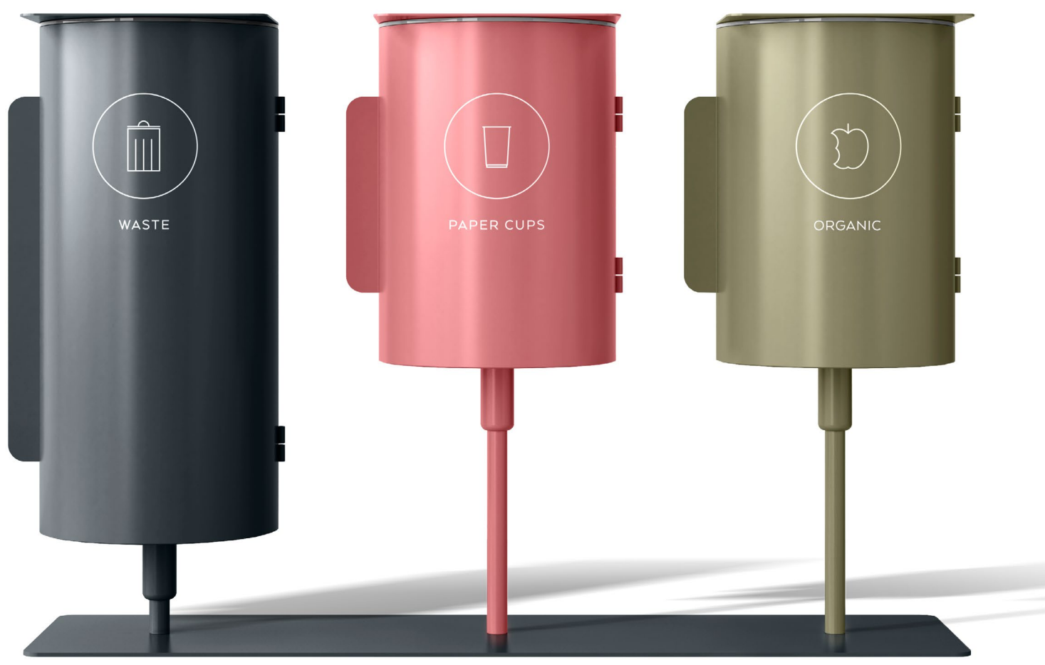
Anthracite RAL 7016 Old pink RAL 3014 Olive RAL 6013

Flexible recycling piece made of resistant Swedish steel. Available in 11 standard colours and delivered with specially designed symbols for easy sorting. Birdie is made in two sizes and holds 43 L (Birdie 500) and 63 L (Birdie 750). Both have soft closing lids and inlets in stable quality plastic. Birdie is available as floor standing and wall mounted, with matching wall brackets.